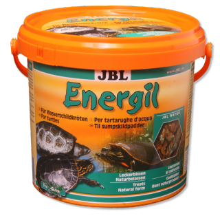
JBL Energil Main food for turtles and pond terrapins