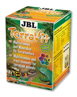
JBL TerraVit Powder Vitamins and trace elements for terrarium animals