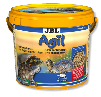
JBL Agil Main foodsticks for turtles 10 – 50 cm in size