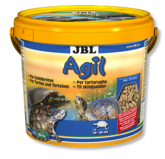
JBL Agil Main foodsticks for turtles 10 – 50 cm in size