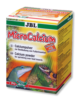
JBL MicroCalcium Mineral supplementary food for all reptiles