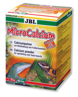
JBL MicroCalcium Mineral supplementary food for all reptiles