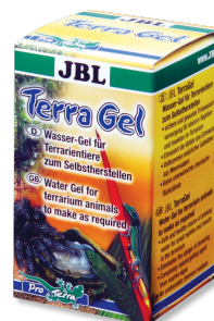
JBL TerraGel Water gel for terrarium animals