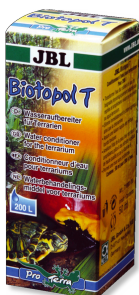
JBL Biotopol T Water conditioner for terrariums