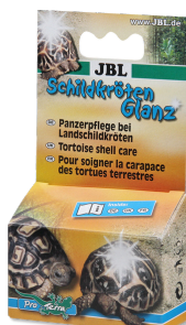
JBL Tortoise shell care Shell care for tortoises