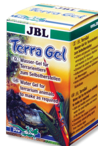
JBL TerraGel Water gel for terrarium animals