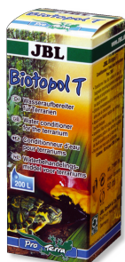
JBL Biotopol T Water conditioner for terrariums