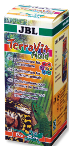
JBL TerraVit fluid Vitamins and trace elements for terrarium animals