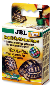
JBL Tortoise Sun Terra Vitamins for tortoises