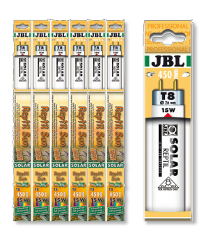
JBL SOLAR REPTIL SUN T8

Special T8 terrarium fluoresc tube for desert animals