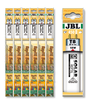
JBL SOLAR REPTIL SUN T8

Special T8 terrarium fluoresc. tube for desert animals