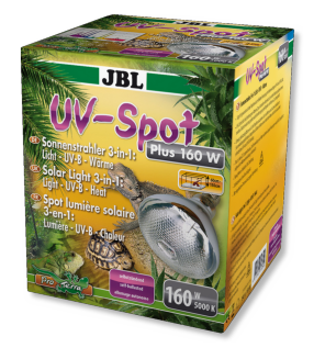
JBL UV-Spot plus UV spotlight with daylight spectrum for terrariums