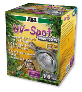
JBL UV-Spot plus UV spotlight with daylight spectrum for terrariums