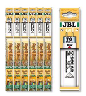
JBL SOLAR REPTIL SUN T8

Special T8 terrarium fluoresc. tube for desert animals