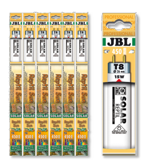
JBL SOLAR REPTIL SUN T8

Special T8 terrarium fluoresc tube for desert animals