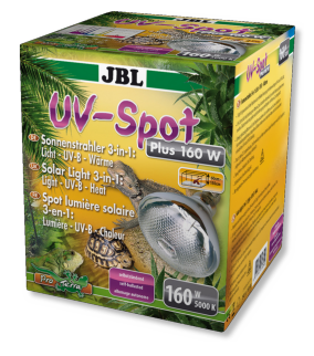
JBL UV-Spot plus UV spotlight with daylight spectrum for terrariums