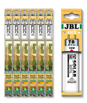
JBL SOLAR REPTIL JUNGLE T8

T8 terrarium fluorescent tube for rainforest animals