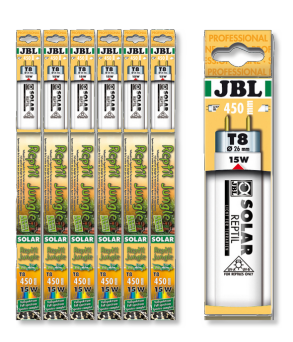
JBL SOLAR REPTIL JUNGLE T8 R terrarium fluorescent tuk

T8 terrarium fluorescent tube for rainforest animals