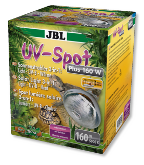
JBL UV-Spot plus UV spotlight with daylight spectrum for terrariums