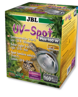
JBL UV-Spot plus UV spotlight with daylight spectrum for terrariums