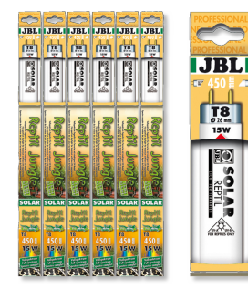
JBL SOLAR REPTIL JUNGLE T8 T8 terrarium fluorescent tube for rainforest animals