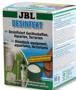
JBL Desinfekt Disinfettante per acquari