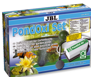
JBL PondOxi-Set Aeration set with air pump for garden ponds