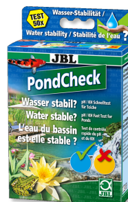
JBL PondCheck Quick test to determine the pH and KH values