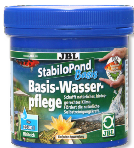
JBL StabiloPond Basis Basic care product for all garden ponds