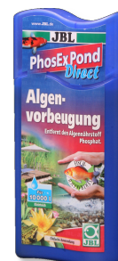
JBL PhosEX Pond Direct Phosphate remover for ponds