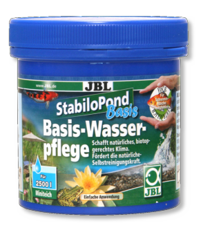
JBL StabiloPond Basis Basic care product for all garden ponds