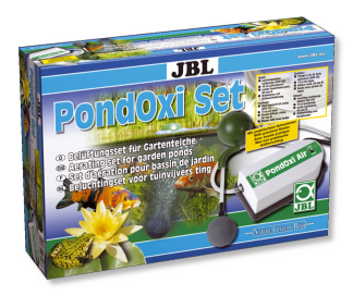
JBL PondOxi-Set Aeration set with air pump for garden ponds