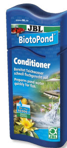
JBL BiotoPond Water conditioner for ponds