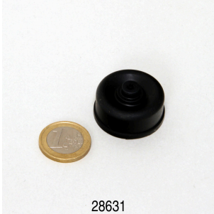
28631 JBL PondOxi diaphragm set