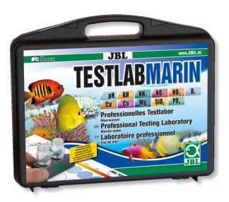
JBL Testlab Marin Professional test case for the analysis of saltwater