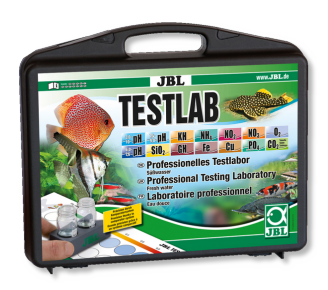
JBL Testlab Test case with 13 tests f. freshwater analysis Testlab