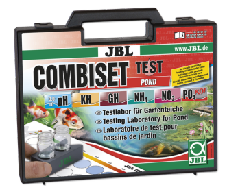
JBL Test Combi Set Pond

The most important water tests for garden ponds