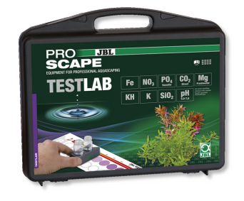
JBL Testlab ProScape Test case for water analysis in plant aquariums