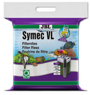
JBL Symec VL Filter wool fleece to remove water cloudiness