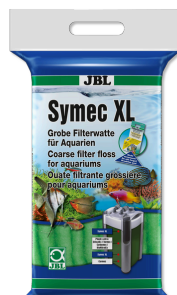
JBL Symec XL Coarse filter wool to remove all types of water cloudiness