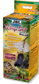
JBL TempSet angle Installation kit for lamps in terrariums