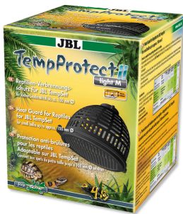
JBL TempProtect II light Reptile thermal burn protection for JBL TempSet items