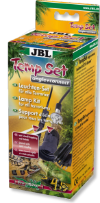
JBL TempSet angle+ connect Installation kit for lamps in terrariums