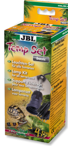
JBL TempSet basic Installation kit for lamps in terrariums