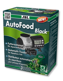
JBL AutoFood BLACK Black automatic feeder for aquarium fish