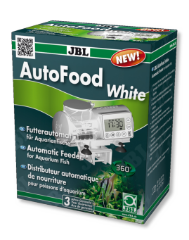
JBL AutoFood WHITE White automatic feeder for aquarium fish