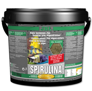
JBL Spirulina Premium main food for algaeeating aquarium fish