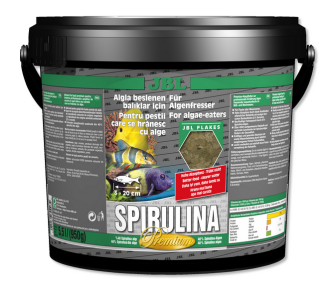
JBL Spirulina Premium main food for algaeeating aquarium fish