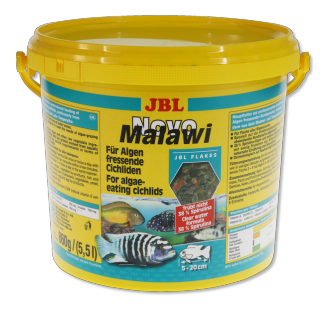
JBL NovoMalawi Main food flakes for algaeeating cichlids