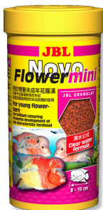
JBL NovoFlower mini Complete food for Flowerhorn Cichlids up to 12 cm