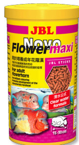
JBL NovoFlower maxi Complete food for Flowerhorn cichlids from 12 cm upwards