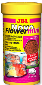
JBL NovoFlower mini Complete food for Flowerhorn Cichlids up to 12 cm