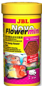
JBL NovoFlower mini Complete food for Flowerhorn Cichlids up to 12 cm