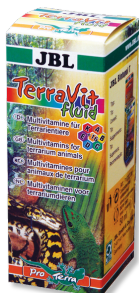
JBL TerraVit fluid Vitamins and trace elements for terrarium animals