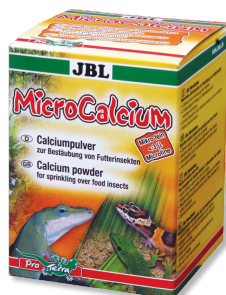
JBL MicroCalcium Mineral supplementary food for all reptiles