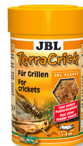
JBL TerraCrick Complete food for feeder insects