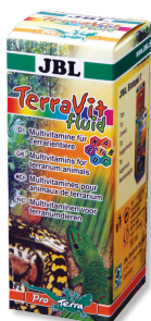
JBL TerraVit fluid Vitamins and trace elements for terrarium animals