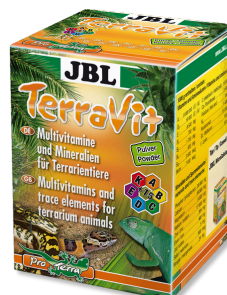
JBL TerraVit Powder Vitamins and trace elements for terrarium animals