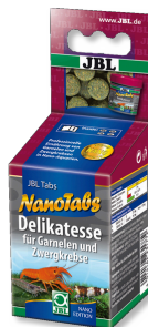
JBL NanoTabs Main food for shrimp and dwarf crayfish