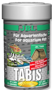
JBL Tabis Premium food tablets for freshwater and marine fish