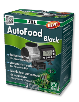
JBL AutoFood BLACK Black automatic feeder for aquarium fish