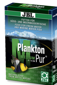
JBL PlanktonPur MEDIUM Treats for large aquarium fish