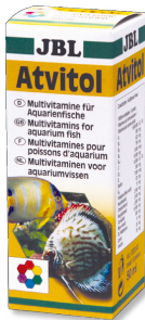
JBL Atvitol Multivitamin drops for aquarium fish