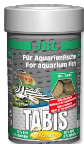
JBL Tabis Premium food tablets for freshwater and marine fish