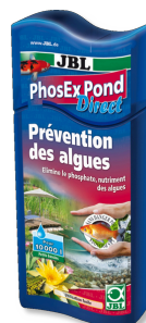
JBL PhosEX Pond Direct Phosphate remover for ponds