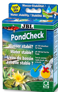
JBL PondCheck Quick test to determine the pH and KH values