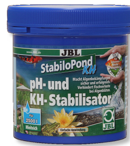
JBL StabiloPond KH pH balancer for garden ponds