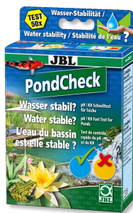
JBL PondCheck Quick test to determine the pH and KH values