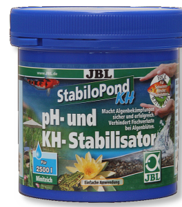
JBL StabiloPond KH pH balancer for garden ponds