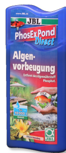
JBL PhosEX Pond Direct Phosphate remover for ponds