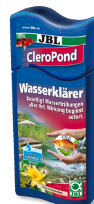
JBL CleroPond Water clarifier for the elimination of water cloudiness