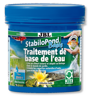
JBL StabiloPond Basis Basic care product for all garden ponds