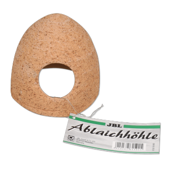
JBL Ceramic spawning cave Ceramic cave for freshwater aquariums