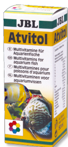
JBL Atvitol Multivitamin drops for aquarium fish