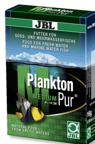
JBL PlanktonPur MEDIUM Treats for large aquarium fish