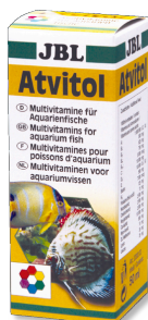
JBL Atvitol Multivitamin drops for aquarium fish