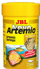
JBL NovoArtemio Artemia supplement diet for all aquarium fish