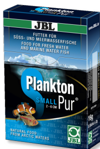
JBL PlanktonPur SMALL Treats for small aquarium fish