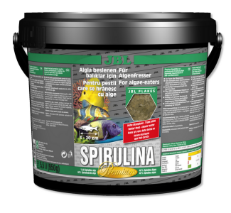
JBL Spirulina Premium main food for algaeeating aquarium fish