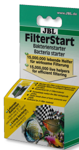
JBL FilterStart Bacteria for the activation of filters