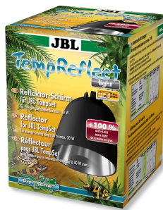
JBL TempReflect light Reflector screen for energy- saving lamps