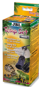
JBL TempSet basic Installation kit for lamps in terrariums