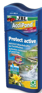
JBL AccliPond Water conditioner for ponds