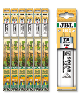
JBL SOLAR REPTIL JUNGLE T8

T8 terrarium fluorescent tube for rainforest animals