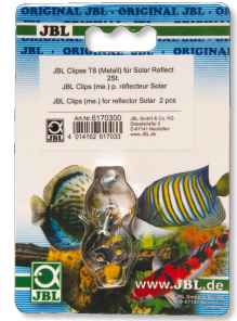
JBL Clips T5/T8 (Metal) Metal holder für fluorescent tubes