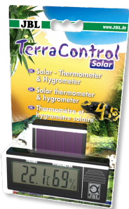
JBL TerraControl Solar Solar-powered thermometer + hygrometer for terrariums