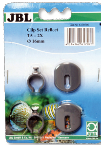
JBL SOLAR REFLECT Clip Set Holder for fluorescent tubes