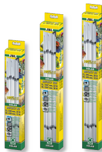
JBL SOLAR Reflect T5/ T8 - 895-1500 mm Reflector panel for fluorescent tube